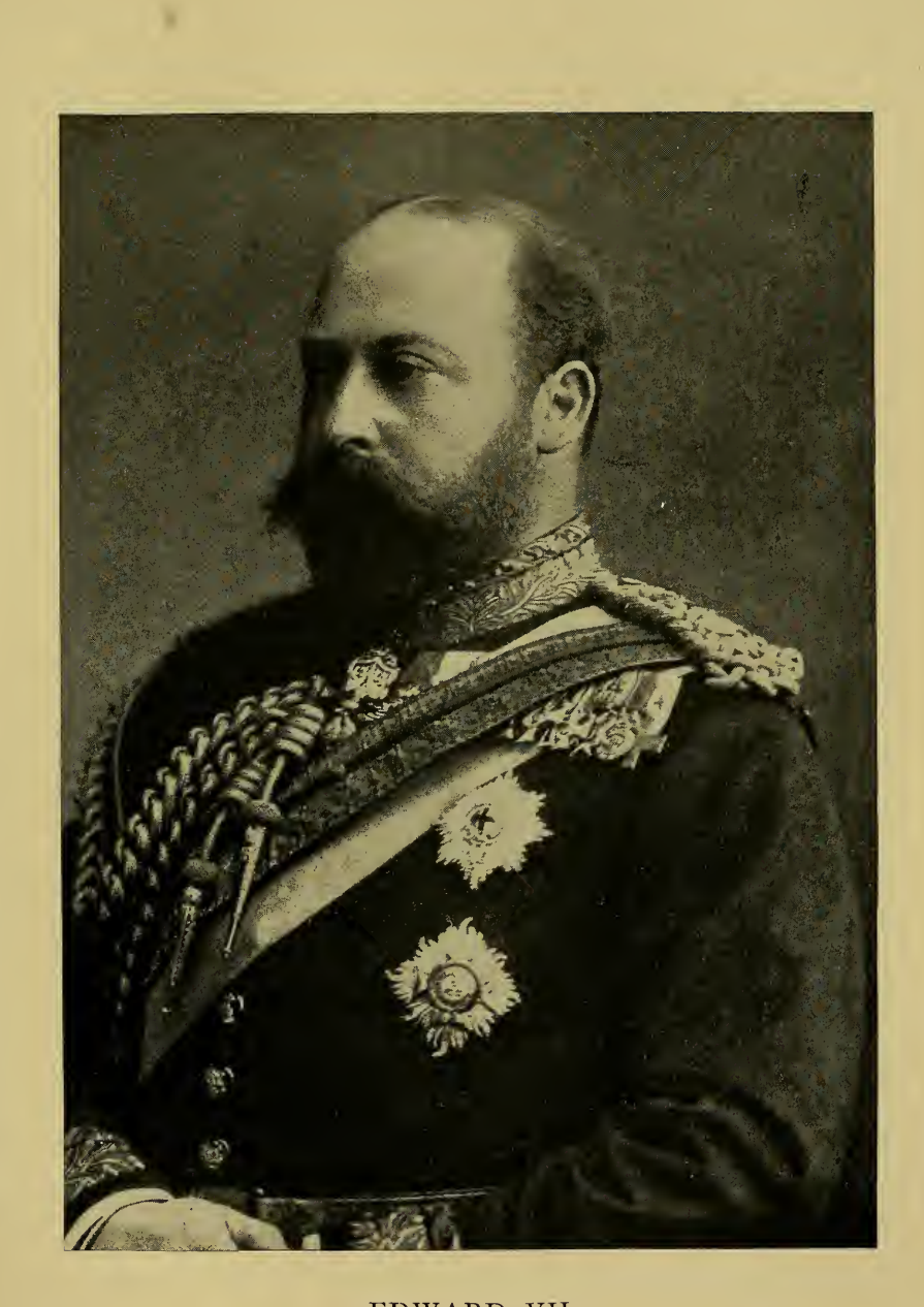
EDWARD VII. From a photograph taken when he was Prince of Wales.